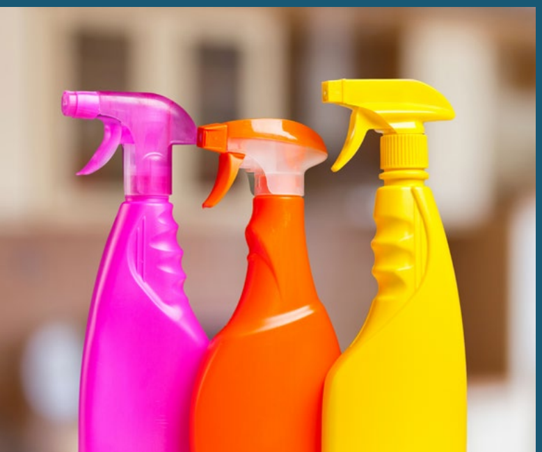
Typical Applications: Packaging / laminating applications