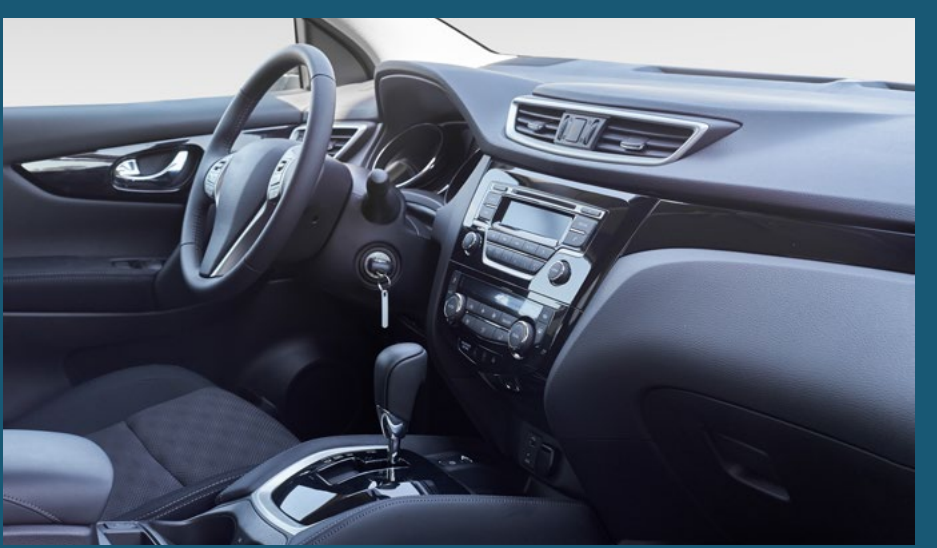
Typical Applications: Interior and exterior automotive plastic / Waterproofing membranes